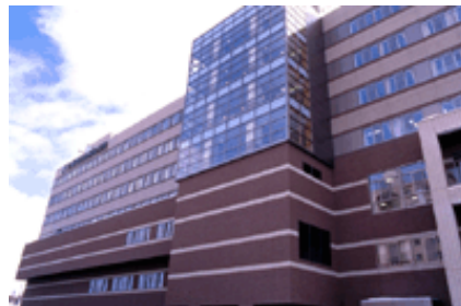
Hokkaido Social Medicine Hospital